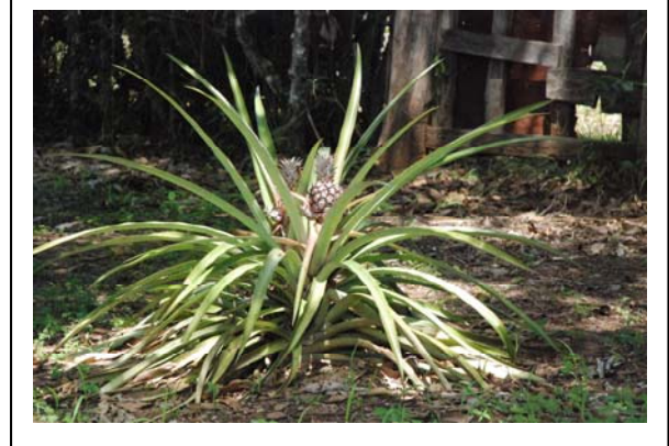
One of many pineapple plants growing in our new front yard!