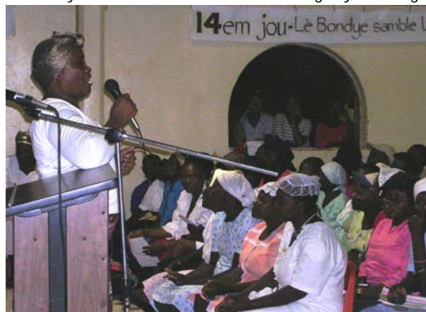
Last year's Women's Conference- eagerly learning

This eager attendee (at right) is recording the message by balancing her cassette player on her head during the service. Thus, it will be shared with many more ladies.