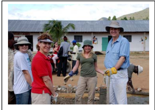
MN team in action with results enjoyed below...January 2007