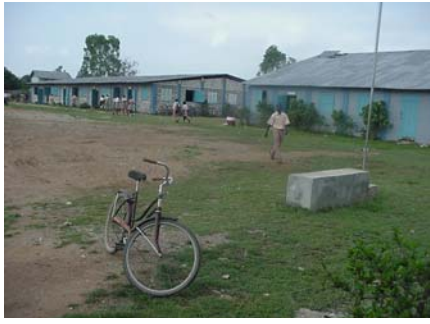
Campus of College de la Grace (above); Students on the internet in the computer lab (below)