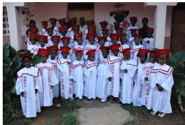
Kindergarten Class of 2007 (above) They all look very serious, don't they?

On June 22, it will be graduation day for the school's kindergarten class. All of the pre-school classes will be in attendance to perform an exhibition for their parents and families. In Haiti, this is likely the only graduation they will attend unless they go to university. There is not a formal high school graduation as the students must pass national exams and those results are not available until long after the school year is over. This past year, a full 25% of our student body was attending due to the provision of sponsors from the U.S. If you'd like information on how to help in that way, contact our office. It only costs $1/day and makes a huge difference in the lives of these children and their families.